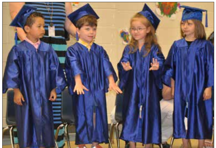
Stark DD Early Childhood 2015 Preschool graduates perform “The Freeze” during the May 28th ceremony.