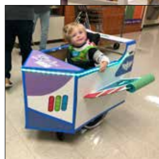
Hudson at Halloween time